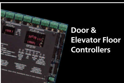
Door & Elevator Floor Controllers