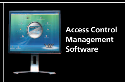
Access Control Management Software