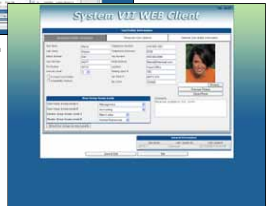
Card Holder Edit Screen